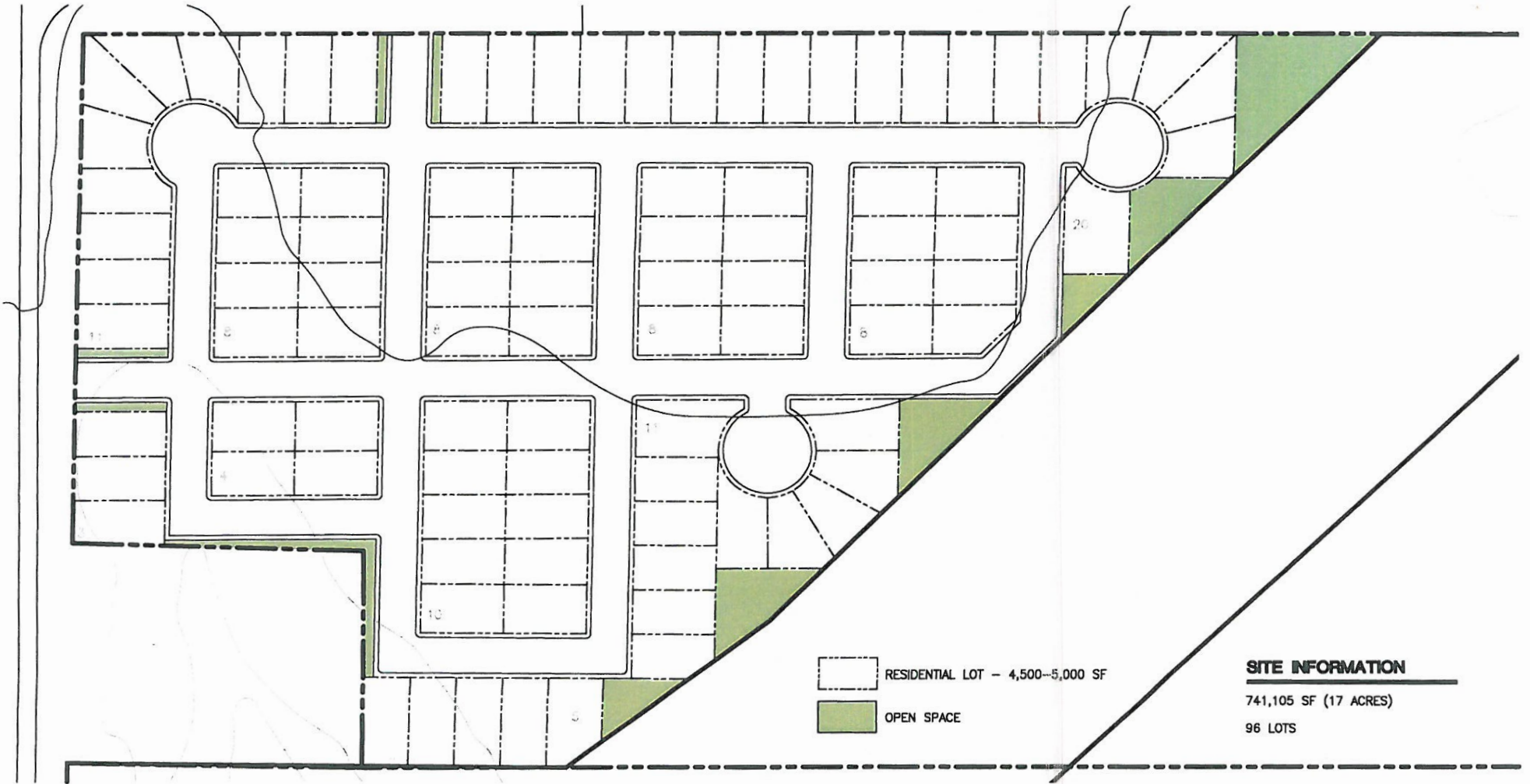
LOT LAYOUT - A